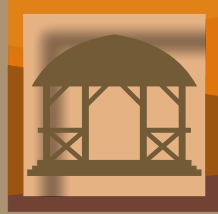
Wide Roof ( Gazebo)