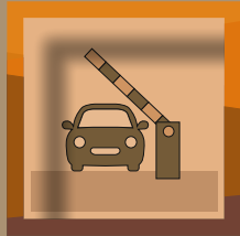
Wide Entry Gate